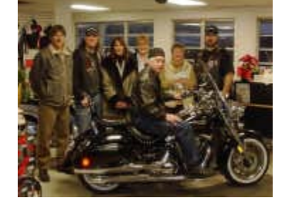
2005 Eastport Excursion